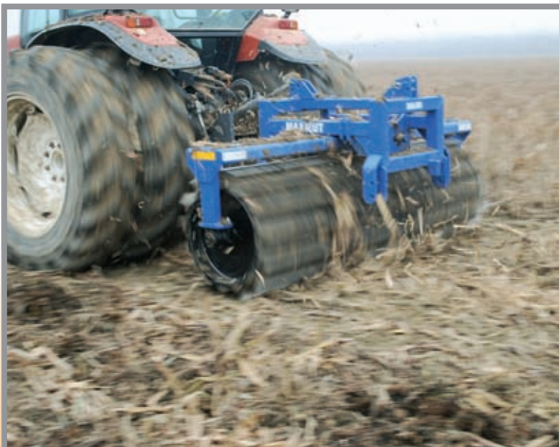
MaxiCut 300 - can be rear or front mounted.

Maxicut is an implement, which is developed to cope with the residual plants on the surface of the ground, without destroying the roots.