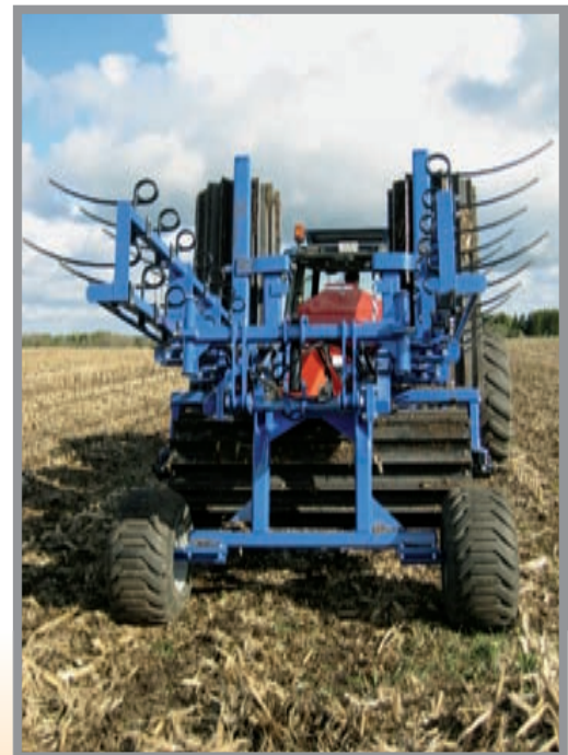
MaxiCut in transport position.