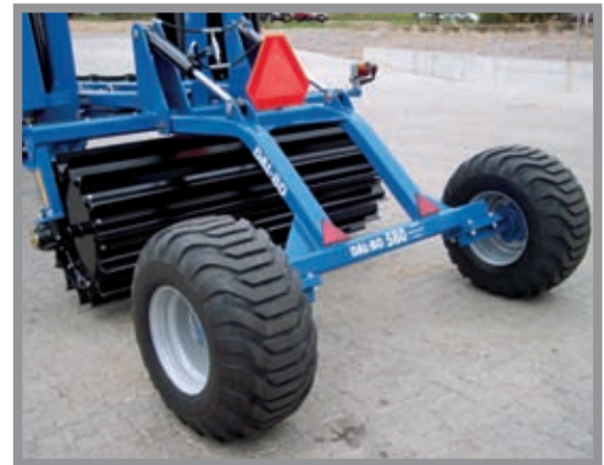
MaxiCut 600 is supplied as standard with 400/60x15.5 wheels.

Maxicut is an implement, which is developed to cope with the residual plants on the surface of the ground, without destroying the roots.