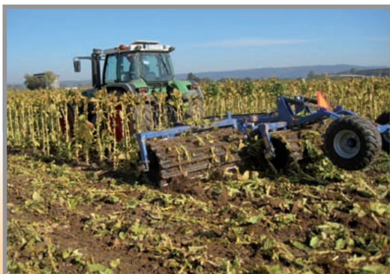
MaxiCut in tobacco.